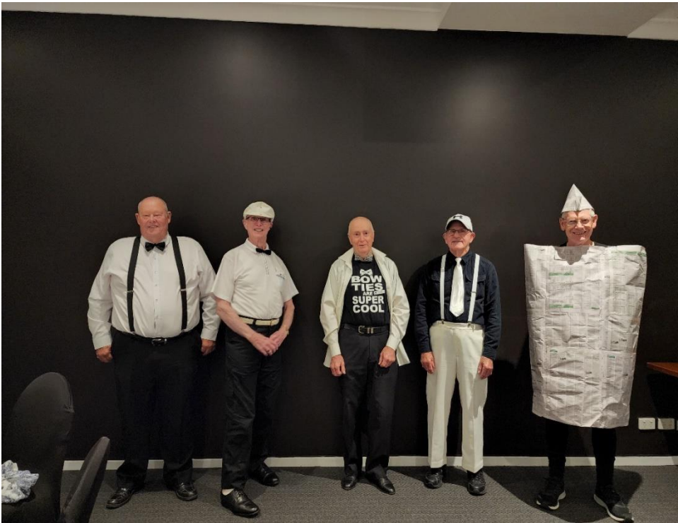
Mount Gambier and the Limestone coast Black and White theme night. Gents.