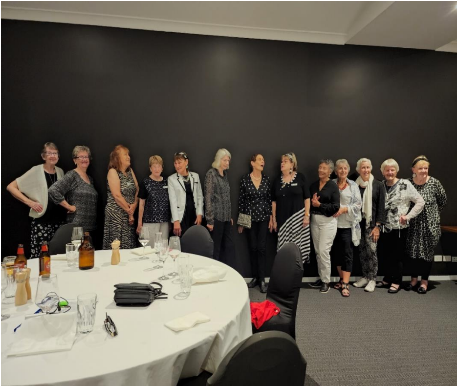
Mount Gambier and the Limestone coast Black and White theme night. Ladies.