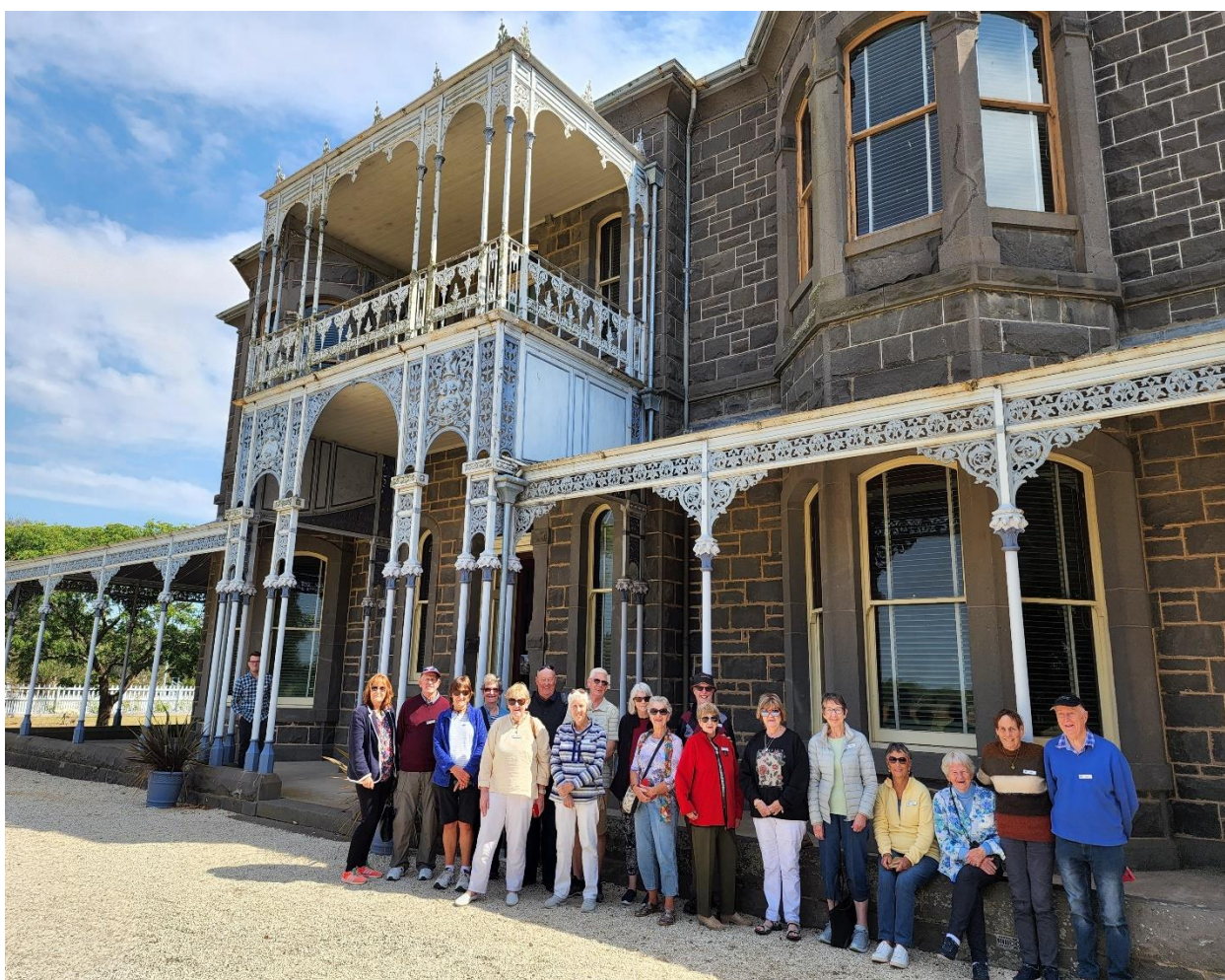
Mount Gambier and the Limestone Coast Tour, Guided tour of Barwon Park House.