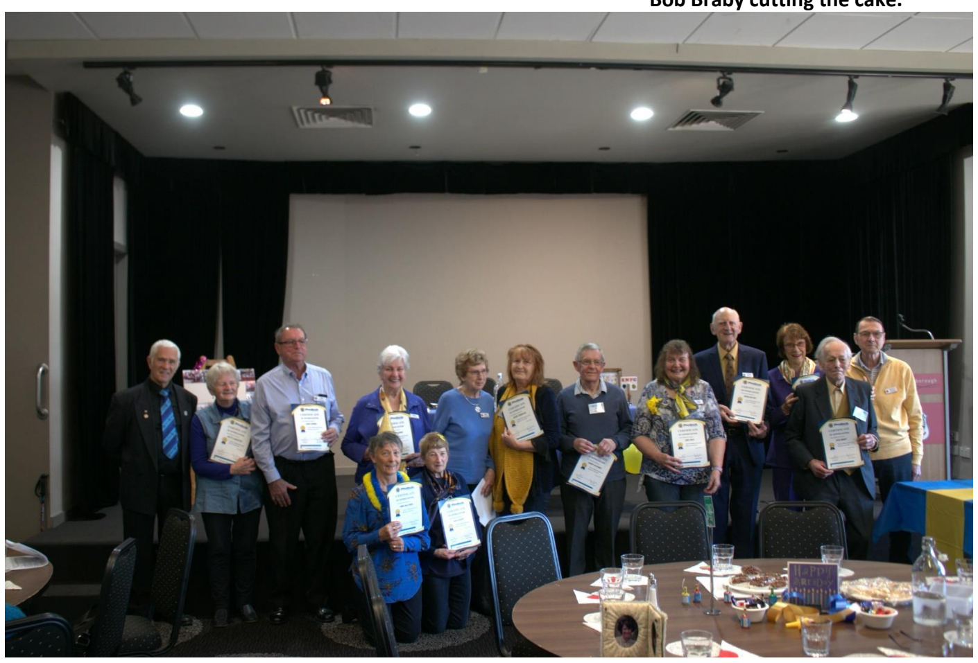
Long term Members receiving their Certificates.