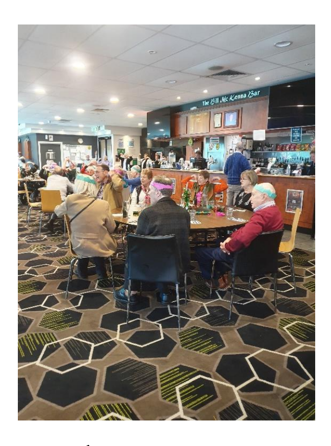
CHRISTMAS IN JULY AT MONTY R.S.L.