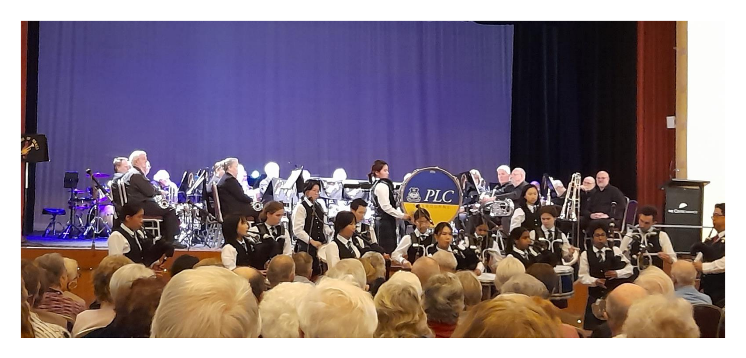
Legends of Brass band with Melbourne Male Welsh Choir and Presbyterian Ladies College Pipe Band.