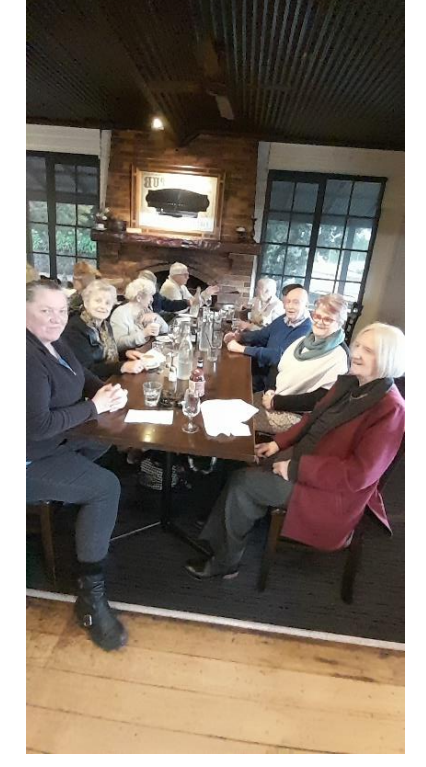
Very nice lunch enjoyed by all at the Kinglake hotel.