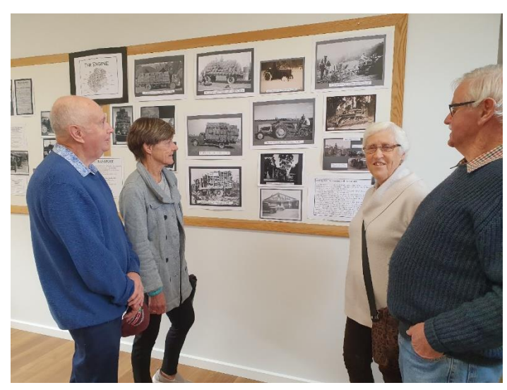
Lots of very interesting information on The history of Kinglake.