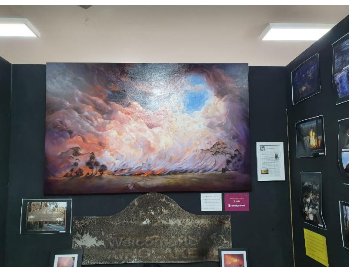
"Flight from the Inferno" a painting by Michelle Bolmartis is the centrepiece of a Display dedicated to the Black Saturday fires.