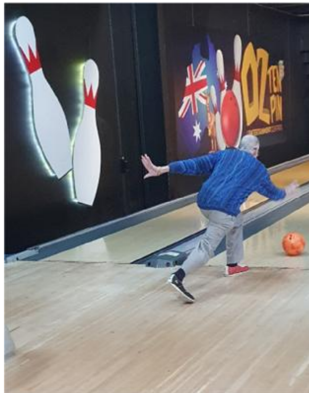
3 rd Thursday 10 pin Bowling.