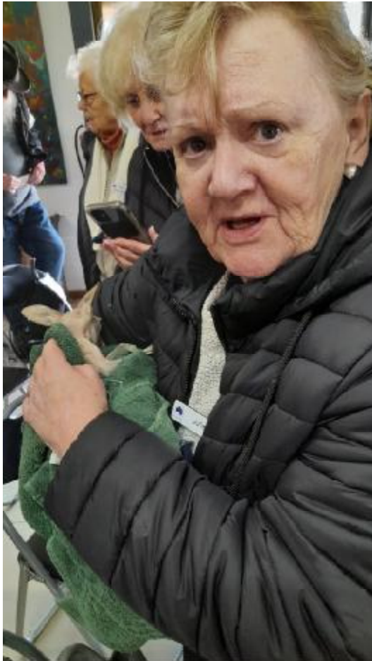
Joey nursing time