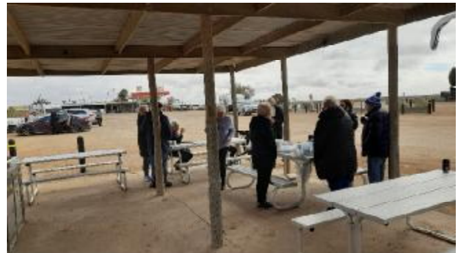
Morning tea Spuds Roadhouse.