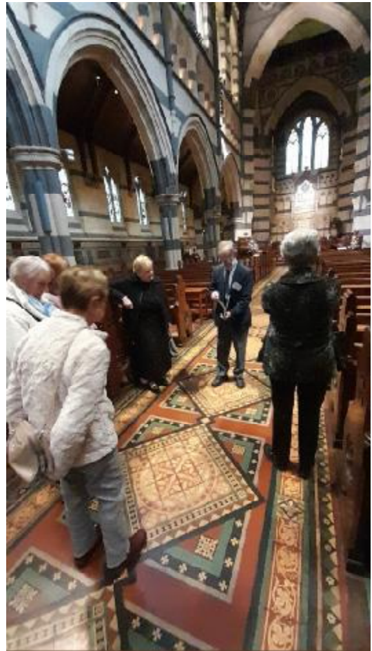
St Pauls Cathedral Tour.