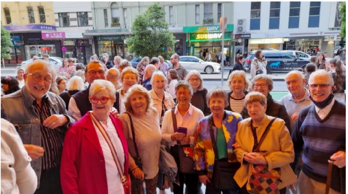
Lunch and Theatre to see Six.