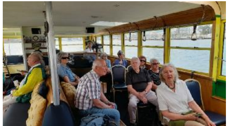
Third Thursday outing cruise on the Tram Boat from Victoria Harbour up the Maribyrnong River to Poyntons Nursery.