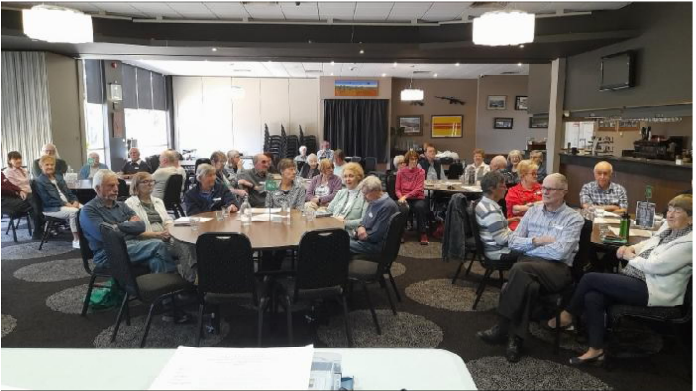
October General Meeting.