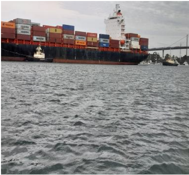
You need to give way when they are bigger than you.