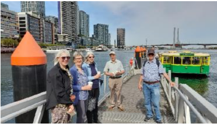
Gathering to board the Tram Boat.