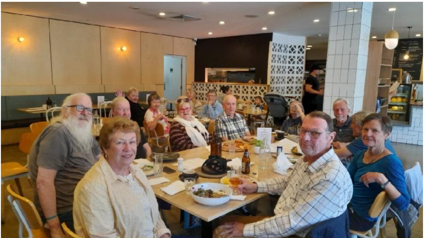
First Thursday Walk then lunch at Hunter Café Rosanna.