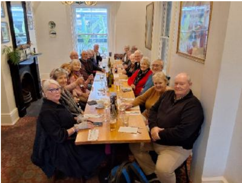
LUNCH AT THE MINT RESTAURANT.