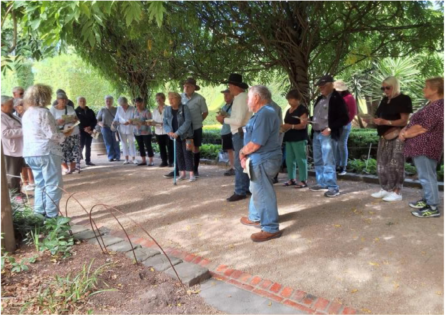
A day out at Alowyn Gardens