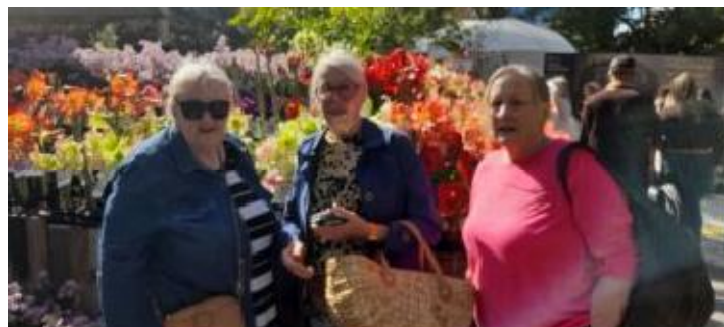
A day at the Melbourne International Flower and Garden show.