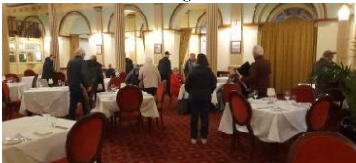
Dinning room Carrington Hotel