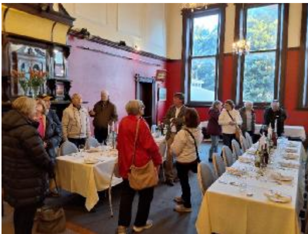
Abercrombie House Dining room.