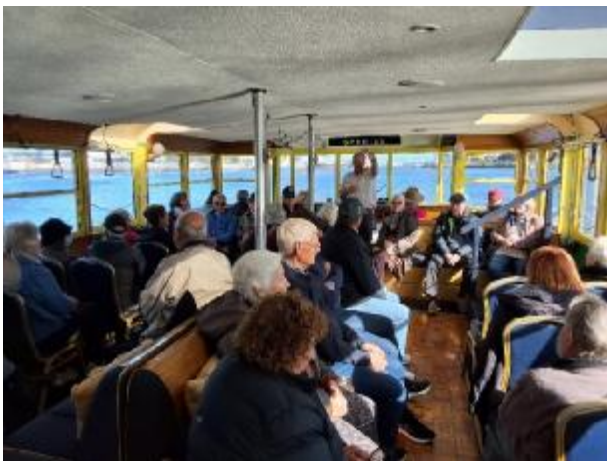
Tram boat cruise relaxing on the water.