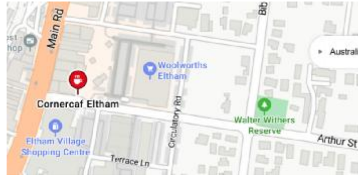
Lunch at Cornercaf