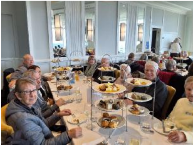
High Tea at Hydro Electric