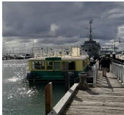
Tram Boat Cruise